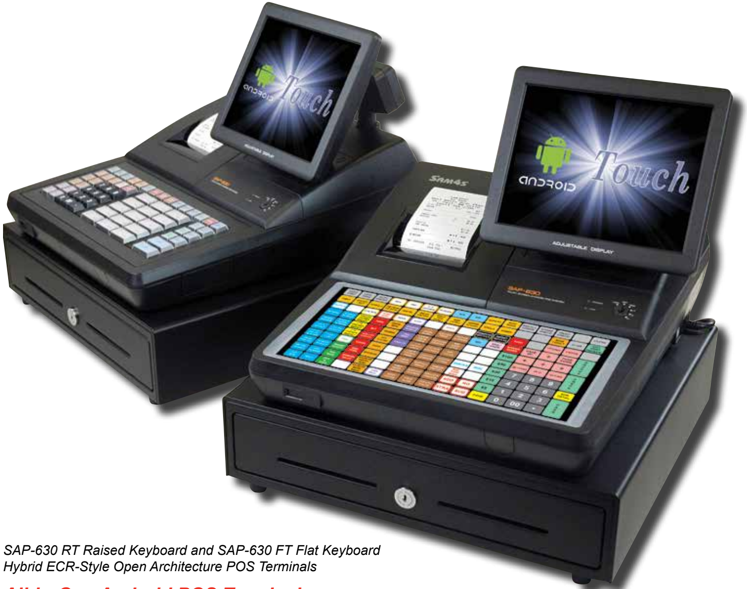
SAP-630 RT Raised Keyboard and SAP-630 FT Flat Keyboard Hybrid ECR-Style Open Architecture POS Terminals

Hybrid ECR-Style Open Architecture POS Terminals