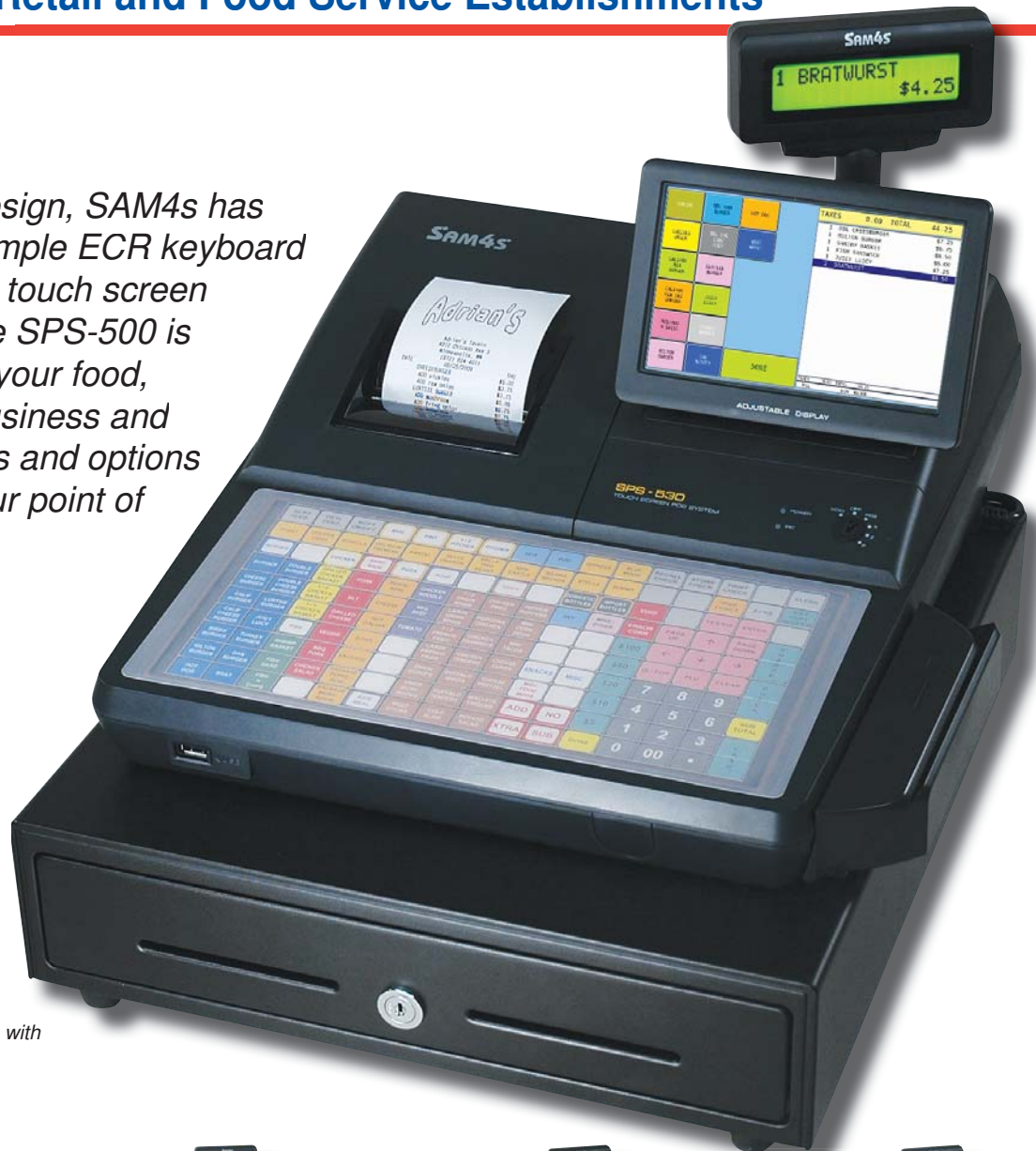
SPS-500 Series Hybrid ECRs Shown with Optional Card Reader

Featuring a hybrid design, SAM4s has combined fast and simple ECR keyboard entry with an intuitive touch screen operator display. The SPS-500 is easily configured for your food, beverage, or retail business and provides the functions and options you need to meet your point of service needs.