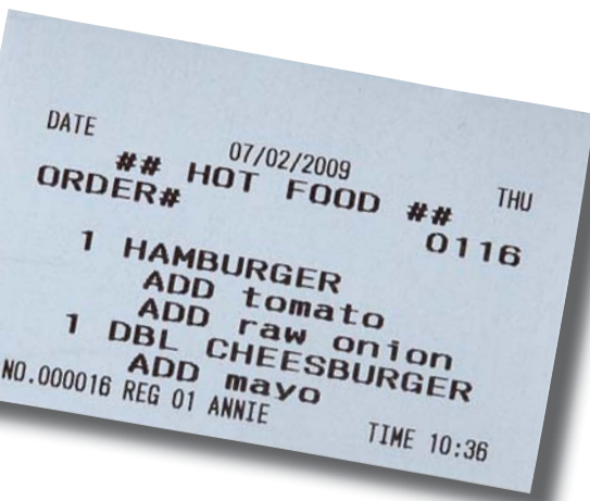
Kitchen requisition printed by the SPS-530 80mm receipt printer shown 75% actual size.